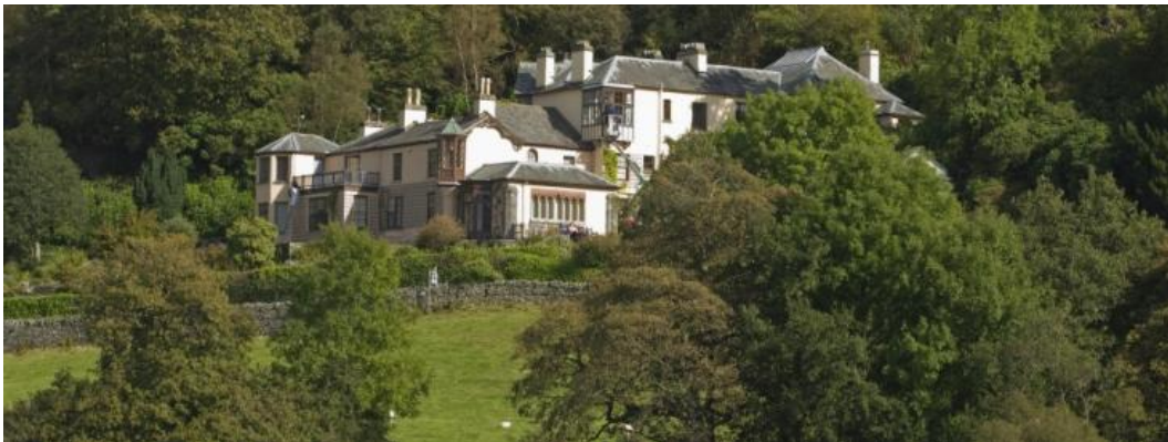
Brantwood/ John Ruskin